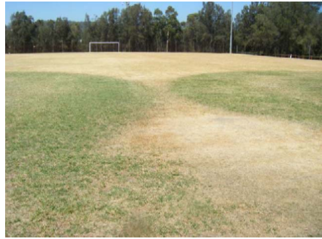
Figure 6 | Inefficient water application.

Lack of head to head coverage is another common issue leading to inefficient water application and a stark difference in turf growth and quality. As evident in Figure 6 , turf exposed to good water coverage is healthy and growing (green) whilst other turfed areas have gone into dormancy (white), on the same field. The pattern of irrigation is therefore easy to see.