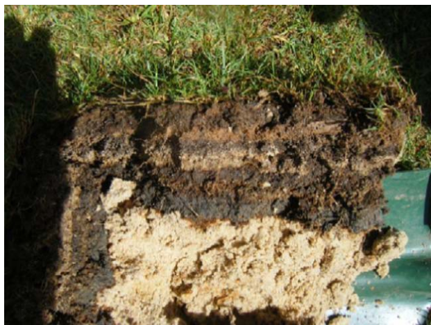
Figure 3 | Profile layering. Note the clay layers above a sandy profile.

‘compacted’ or ‘not-compacted’. Essentially compaction is a sliding scale, with varying degrees and intensity, but for the purpose of public open space assessment, soil compaction is defined when it is having an adverse effect on turf or soil health.