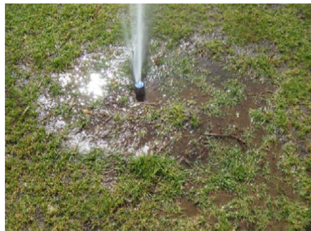
Figure 7 | Sunken sprinkler head.

The efficiency and DU at which an irrigation system applies water has a profound effect on the potable water used on a site. As an example, if a field requires 2 megalitres (ML) of water/year to remain healthy, but the irrigation system has an efficiency of around 40%, double the amount of water, or 4 ML will need to be applied before the required 2 ML has been distributed across of the field. This has significant time and cost implications for park managers.