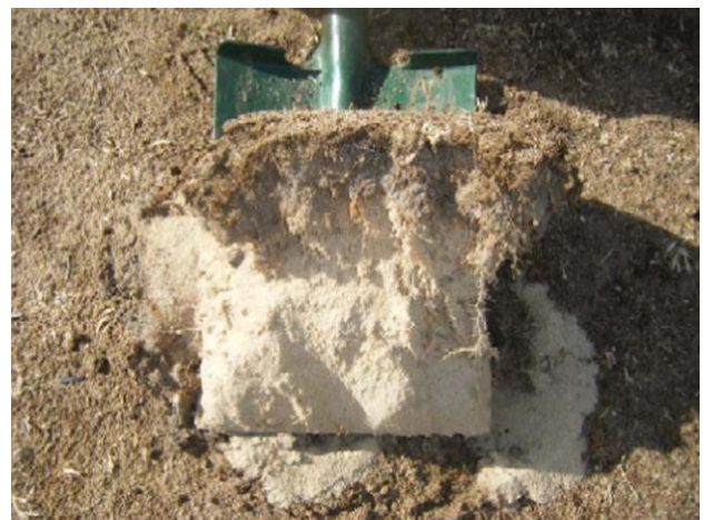
Figure 2 | A typical sand profile. Note the bare patches on the surface.

Soil structure, though potentially intricately described through pedology, can be simply described as either