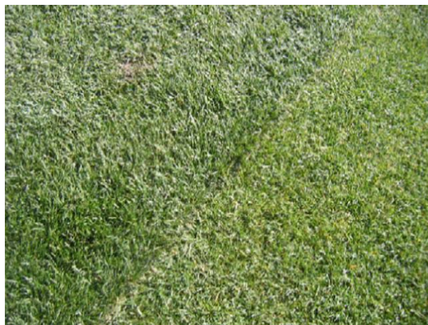
Figure 4 | Elite sports turf.

For the purpose of the ILA methodology and modelling, assessed fields are placed into one of four categories—Elite, Premier, Local or Passive Recreation. These standards provide a basis for the degree and intensity of management practices undertaken on a field, and have a direct impact on watering requirement.