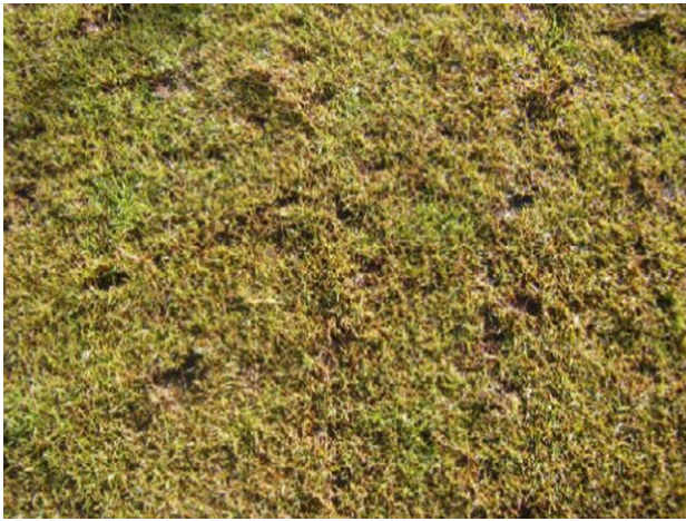
Figure 5 | Local sports turf.

It is important to note that a lush, green, rainfed passive recreation area in Sydney is possible under most climatic scenarios, provided the quality of the underlying soil profile is maintained, and appropriate management practices are implemented, regularly.